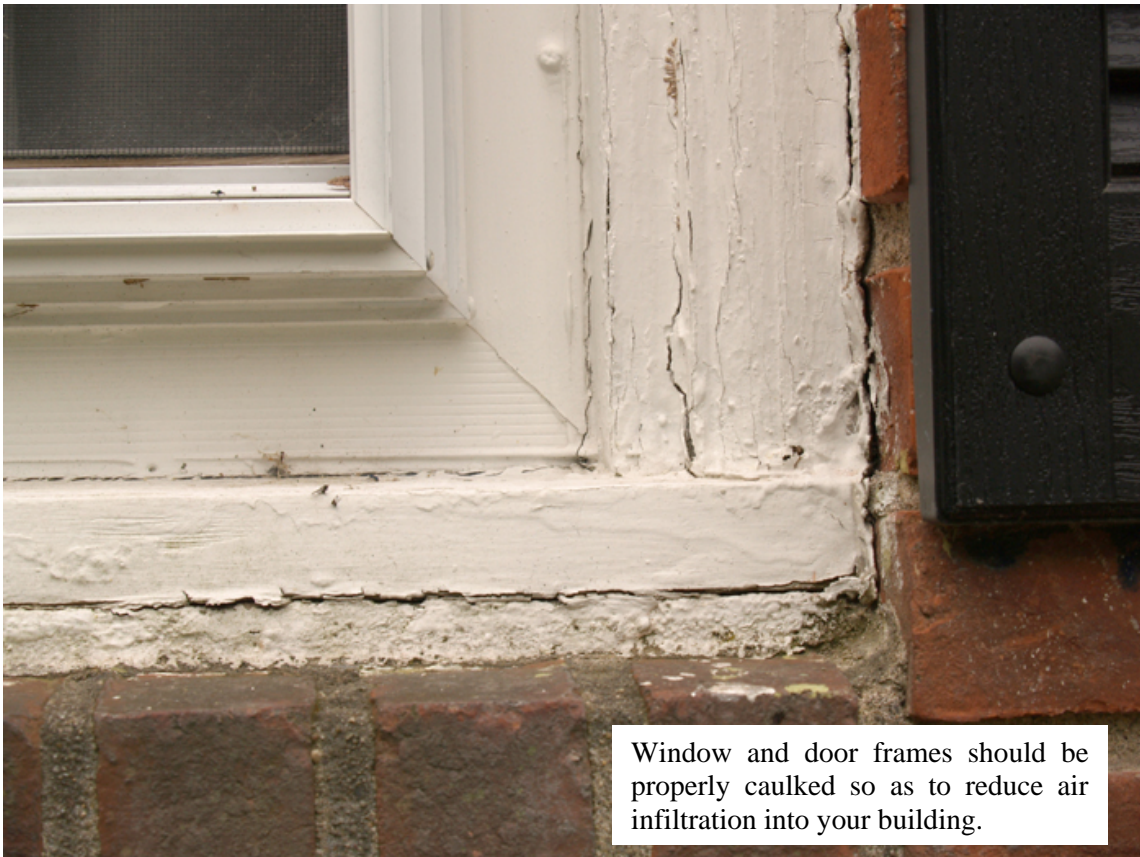
Window and door frames should be properly caulked so as to reduce air infiltration into your building.

If your current heating and cooling systems are outdated and inefficient, working with a professional energy auditor will be especially worthwhile in order to find the most efficient system within the context of your building. If a professional is not involved with the installation, it is best to research and seek out products with an ENERGY STAR® rating. Adjusting the thermostat to maintain cooler temperatures in the winter and warmer temperatures in summer months will reduce energy costs. Furthermore, homeowners should also consider installing timed thermostats that automatically adjust the temperature of the house on a schedule.