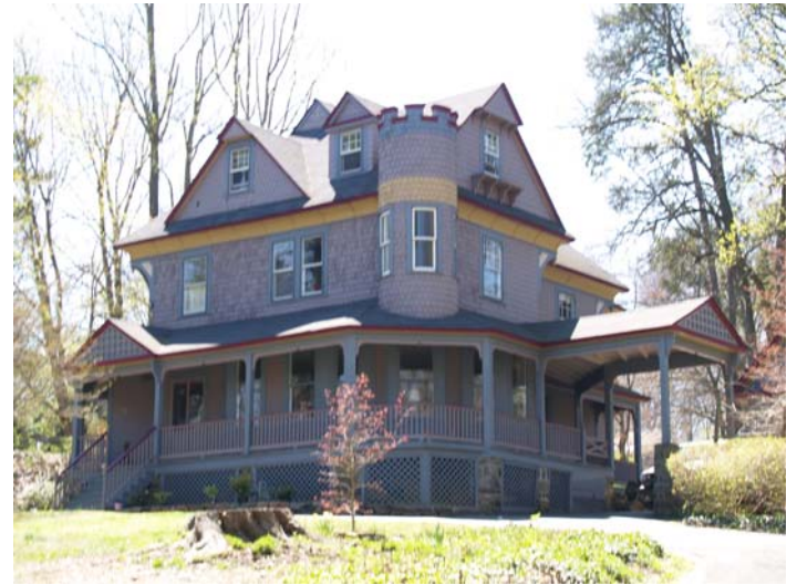
Note the shade provided by the porches and the surrounding trees. These elements keep the house cooler in the summer months.

Residential buildings are responsible for a large portion of the energy consumed in the United States. They currently account for 20.5% of the overall carbon emissions and 36% of all of the electricity that is consumed. With a number of improvements in energy efficiency, the energy consumption statistics associated with residential use can be drastically reduced.