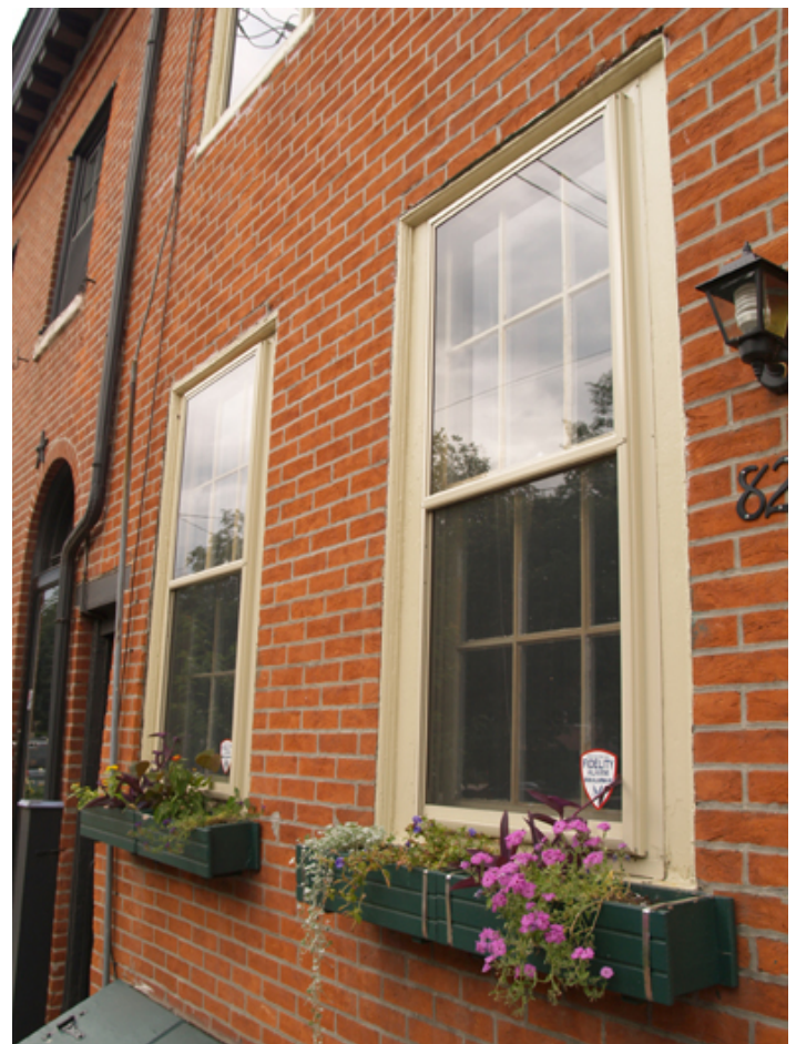
Using exterior storm windows is an effective method for reducing energy losses in historic buildings.

Areas that may be altered to improve energy efficiency, while at the same time preserving the character of historic buildings are: insulation, draft proofing, modifications to windows and doors, efficient appliances, HVAC, landscaping, solar panels and rainwater retention systems. Please consult Cheltenham Township’s Engineering, Zoning and Inspections Department to determine if your “greening” plans require any permits or Board of Historical and Architectural Review (BHAR) approval of Certificate of Appropriateness (COA) applications.