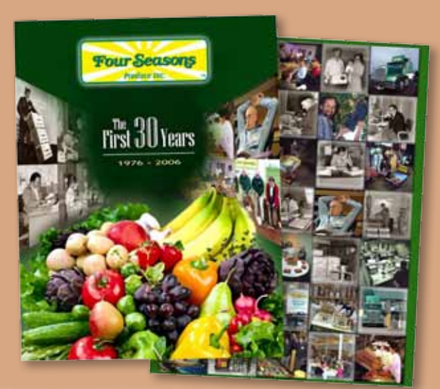
76-page corporate history, Four Seasons Produce, Inc., Denver, PA

60-minute video documentary, southwestern Pennsylvania