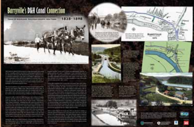
24x36-inch wayside interpretive panel, Town of Highland, Sullivan County, NY