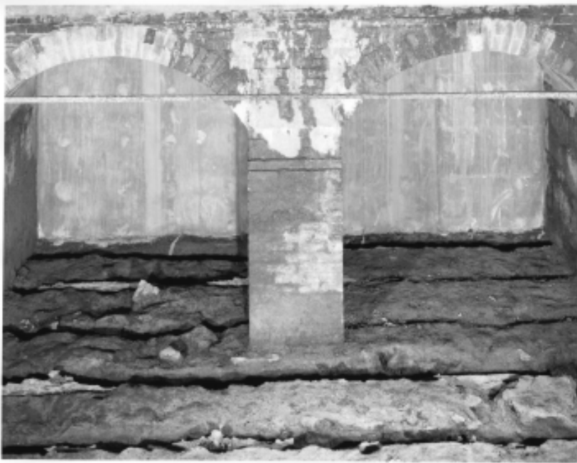
Photo 1 – This photograph of the wheel forebay illustrates the types of archaeological resources that were uncovered at the mid-nineteenth century Fairmount Waterworks in the City of Philadelphia. Visible in the photograph are two brick arches along with remains of the wooden sleepers (found in the channels on the floor).

Archaeological Investigations were conducted as part of the proposed renovation of the Fairmount Waterworks. The Waterworks is associated with an early endeavor to furnish Philadelphia with a commercial water supply. In addition to the archaeological fieldwork, which provided information on the design of the wheel pit and forebay of Wheel 1, Historic American Engineering Record (HAER) Level photography was conducted in order to document both the archaeological site and the physical elements that constitute the building itself.