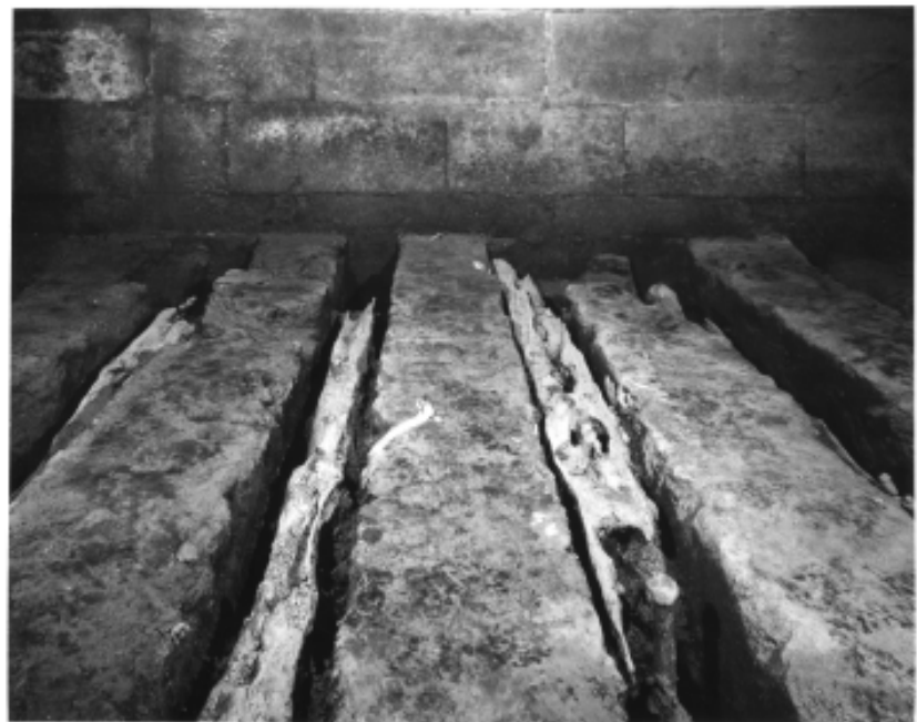
Photo 2 – This photograph depicts a detail of the wooden sleepers found in channels on the floor of the wheel forebay. Also visible in this photograph are remnants of steel bolts. Not visible are two wooden joists which run east to west through the forebay.