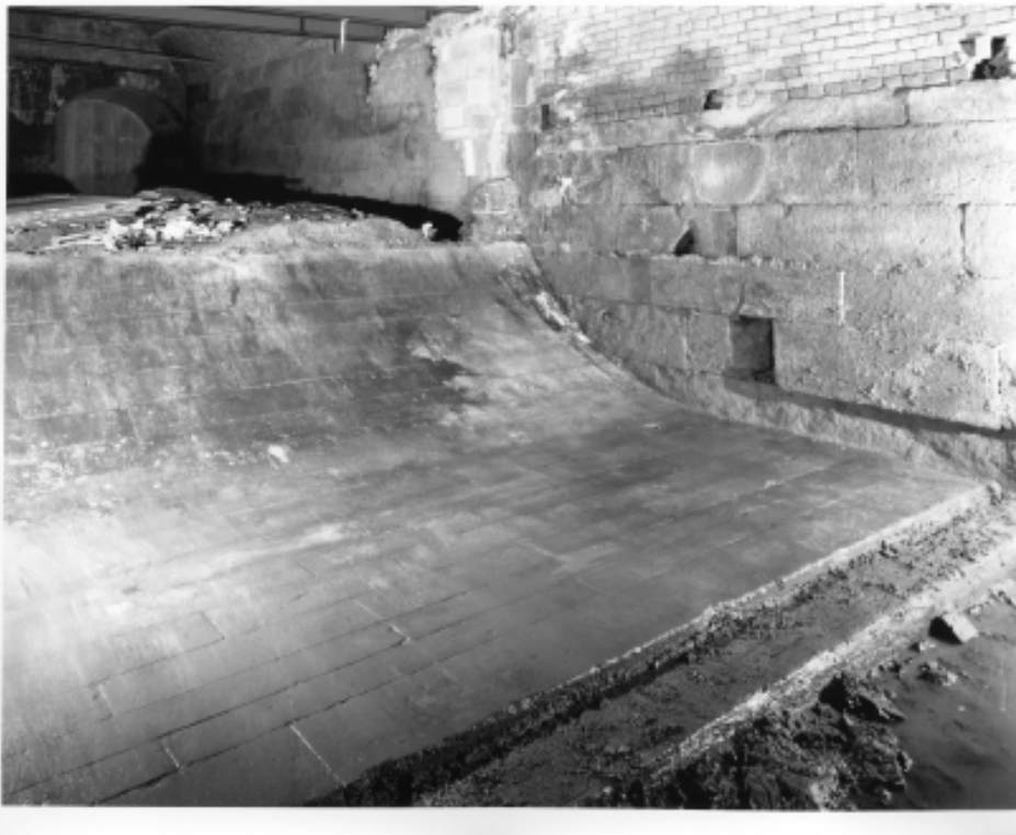
Photo 3 – This photograph shows the sloped stone floor of the wheel pit. The quality of the workmanship and the exceptionally smooth, regular, curving surface of the stones suggests that they were dressed in place. The wheel forebay is located to the left of the wheel pit.