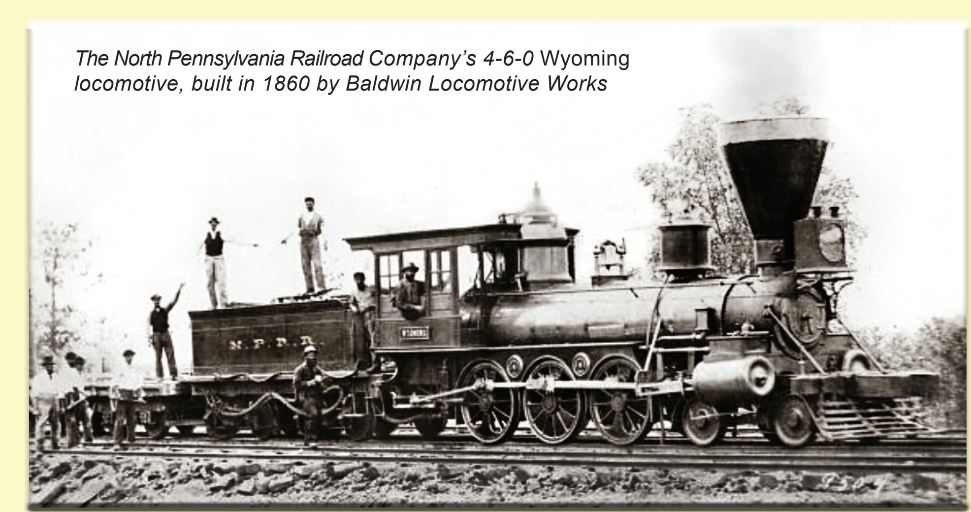
Baldwin Locomotives, Voyageur Press, 2010

From Philadelphia's Great North Route: North Pennsylvania Railroad, to Connect Philadelphia with North Pennsylvania, Western New York, The Lakes and Canada West, 1853